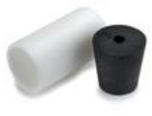
A868 – Sensor Dust Filter Prolong the life of your sensor