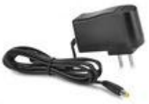
R180 – Replacement AC Adapter For TSB/TWE/TWP Loggers and the KT8/KT6 series