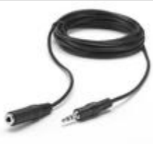
A062 – 10' Adapter Extension Cable Power Extension for R157 AC Adapter