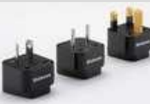
R066 – Universal Plug Kit International kit for Data Loggers