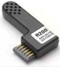
R200 – Temperature/Humidity Sensor Angled, replaceable sensor