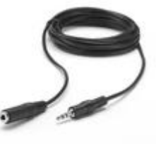
A062 - 10' AC Adapter Extension cable for R157 AC Adapter