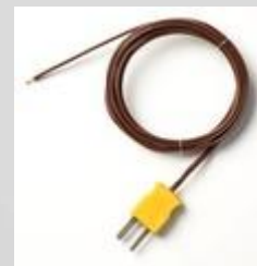
R013 - Temperature Probe Replacement Bead Wire Temperature Probe