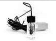
A340 - Glycol Bottle Bottle of Glycol Solution w/ Septum Close