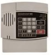
D118 – Remote Monitoring Unit