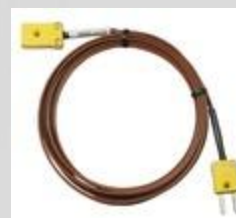
A202 – Thermocouple Extension K-Thermocouple 100' (30m) Extension Cable