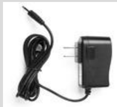
R157 – Replacement AC Adapter