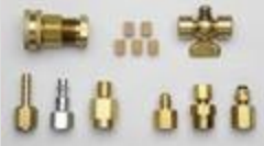
A791 – Pressure Kit Pressure Fitting Accessory Kit