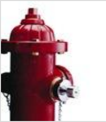
A793 – Hydrant Kit Fire Hydrant Adapter Kit