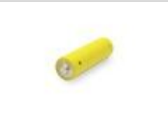
R006 – AA Battery