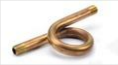
A792 – Pressure Pigtail Steam Pressure Pigtail