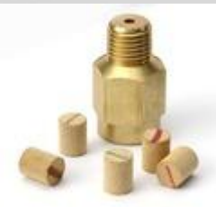
R022 – Pressure Filter Kit Filtre Kit includes Snubber