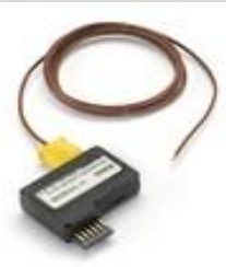
R400 -Replaceable Sensor Single K-TC Temperature Sensor