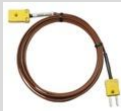
D617 - Probe Extension K-Thermocouple 10' (3m) Extension Cable