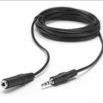
A062 - 10' AC Adapter Extension cable for R157 AC Adapter