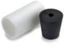
A868 - Sensor Dust Filter Prolong the life of your sensor